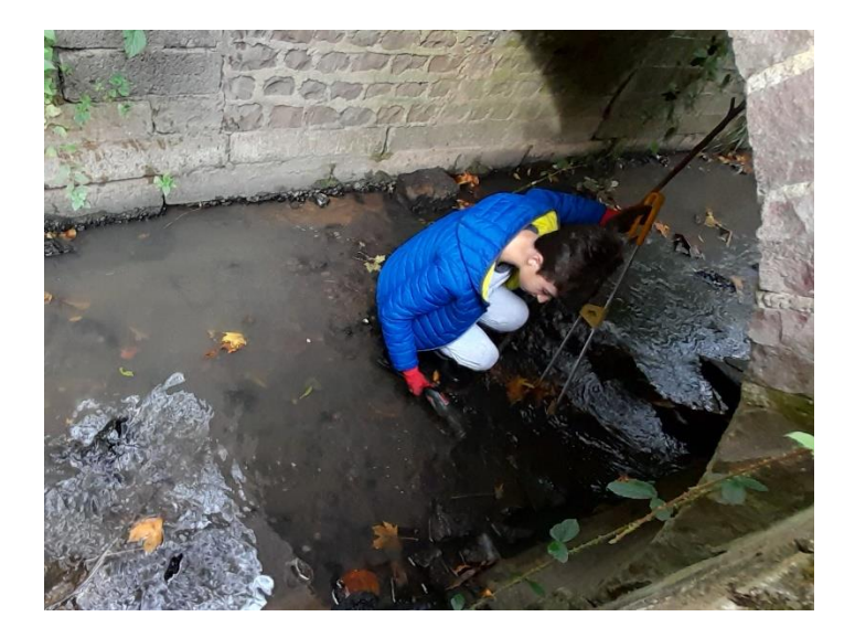
What better way to spend a Sunday afternoon than a peaceful paddle in the stream?

The second 'Clean-the-Stream' event was strongly supported by the Scouts, their leaders and parents, as well as Friends' volunteers. An assortment of junk and debris was removed from the stream resulting in a noticeably cleaner river, supporting insect life and food for birds. The white egret is now a regular visitor and some have seen the kingfisher skimming down the river. Yeading Brook is a Thames tributary and improvements upstream benefit the whole waterway. The Scouts did a magnificent job, starting at Northumberland Road bridge and working down to the stone bridge near Rayners Lane. Sixteen scouts, three leaders and 3 mums ended up muddy, wet and with boots full of water but with a job well done. 'Thank You!' to 4<sup>th</sup> Headstone Scouts.