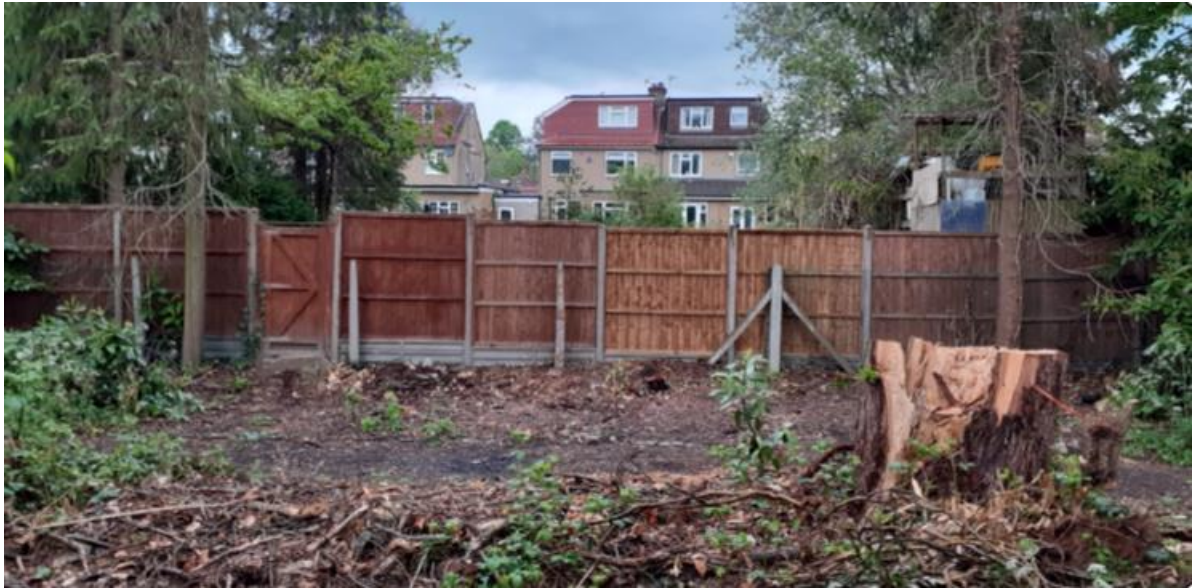
Site of the fallen trees on the 'Shady Walk'

There is some upside in that there is increased day light on the stream which will improve water quality and the Shady Walk is more visible for walkers. A huge 'Thank You' to all the volunteers who cleared the path of fallen branches and debris from stream.