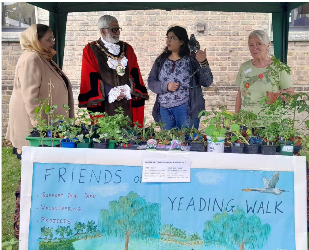
Friends of Yeading Walk talk with the Mayor and his wife at St Alban's Fete

St Alban's Fete on 21 st May enabled the Friends to raise around £120 for the park by selling cuttings and donated plants. Thanks to St. Alban's for inviting us to participate and to all who provided plants and came to support us at the fete. Good luck with your planting!